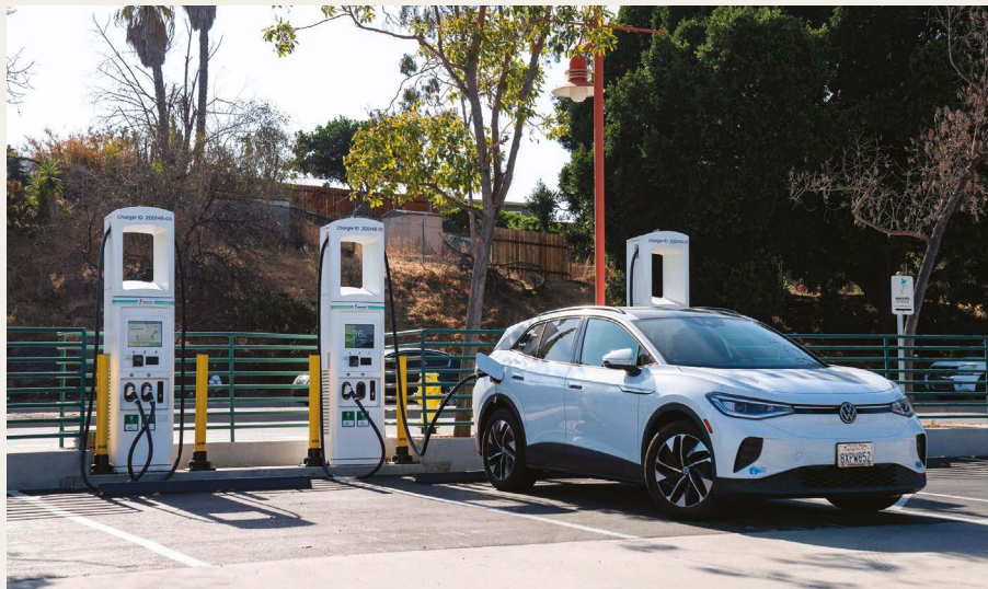
Electric cars could account for more than half of new US passenger-vehicle sales in ten years.

In particular, an infrastructure bill enacted by Congress in 2021 and a massive spending bill known as the Inflation Reduction Act, passed in 2022, are funnelling federal money into charging infrastructure and tax credits for consumers and for automobile or battery manufacturers that upgrade or build new facilities.